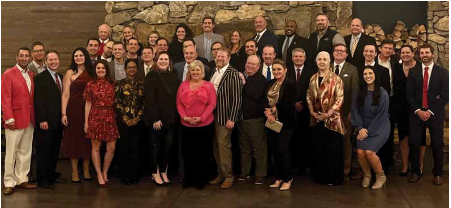
Members of the 2023 Kentucky Justice Association Board of Governors. For a complete list of Board members, see page 5.